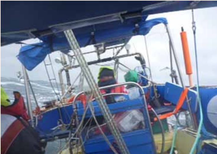
Wild weather in the Southern Ocean

The New Zealand Pilot states the waters around Stewart Island are a particularly stormy part of the world with frequent gales in all seasons that often last many days. The Stewart Island Cruising Guide cautions that there is little difference between the gale frequency in summer and winter months, seasonal predictions are highly unreliable and, that for cruise planning, wind strengths and directions in the vicinity of Stewart Island are a lottery.